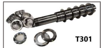
Cambio rapido albero lame Fast replacement blades's shaft