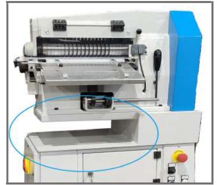
Versione "C" / Type "C"