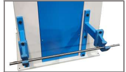
Portarotoli / Rolls holder